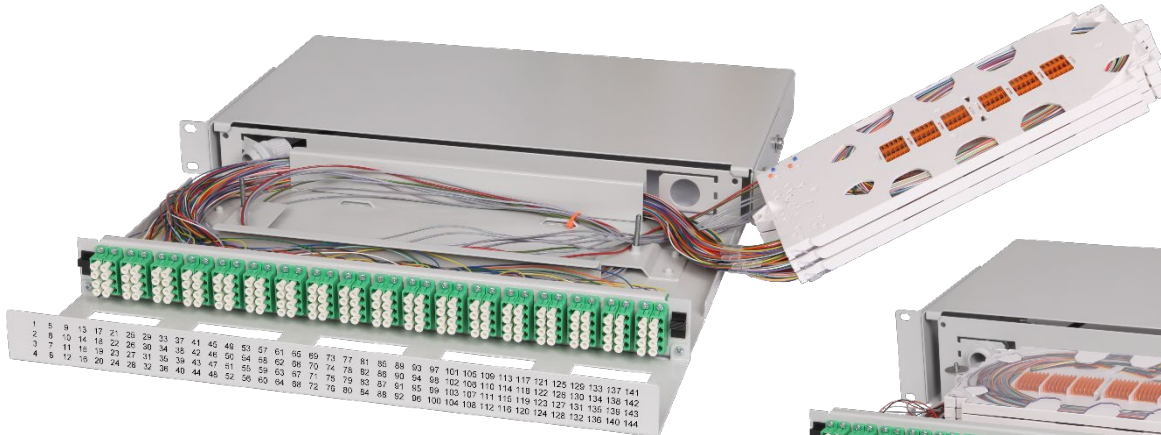
Ultra High Density Fiber Optic Patch Panel UHD ORMP 1U 144LC (removed trays)