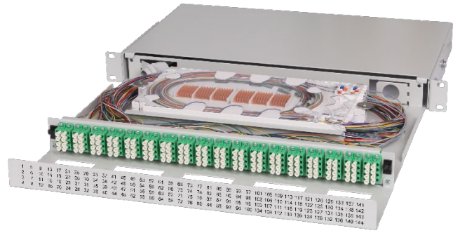
Ultra High Density Fiber Optic Patch Panel UHD ORMP 1U 144LC